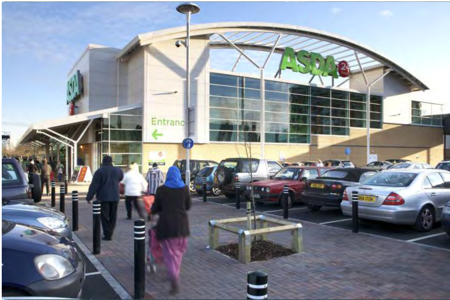
Edmonton Green – Asda