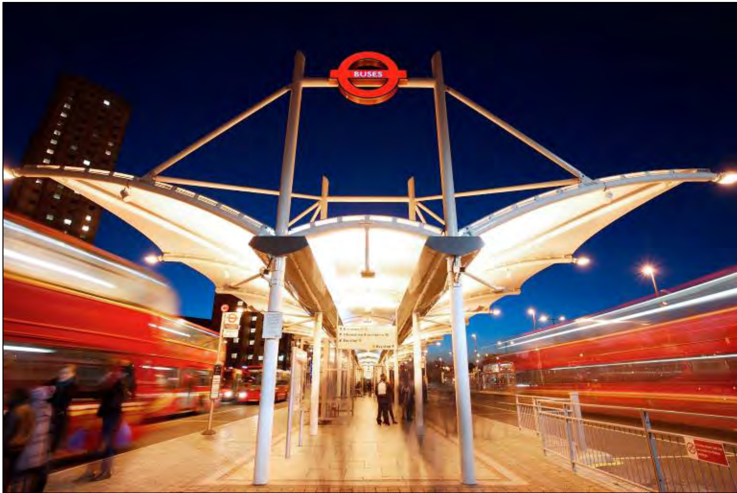
Edmonton Green – Bus Station