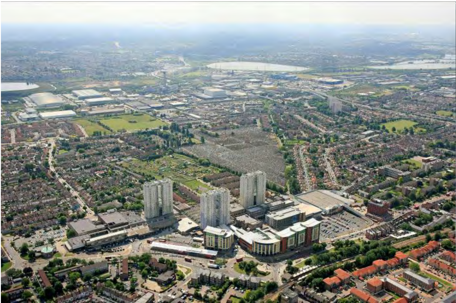
Edmonton Green – Aerial