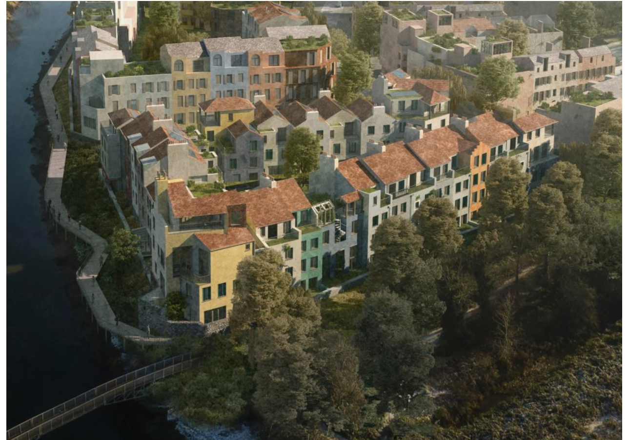
Jacobs Square, Lewes - Ash Sakula Architects

What is the Government doing about quality?