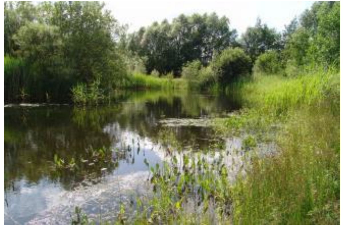
The Wildlife Trusts

What's going to happen to Part 3 of the Bill?